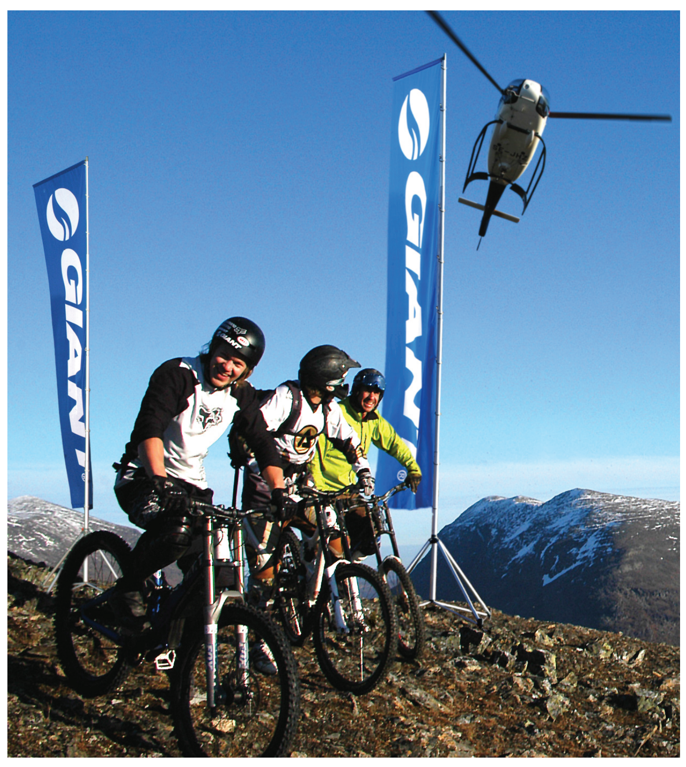
Bring your message to your target audience.