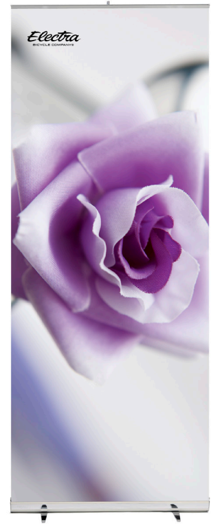
Perfect to use as a single retractable banner as well.