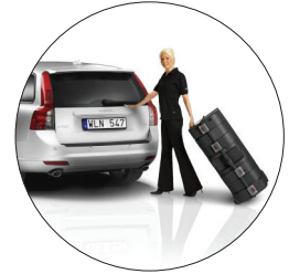
Pack your Expand MediaScreen XL in the Expand PodiumCase, our transport box on wheels that easily converts into a spacious counter.